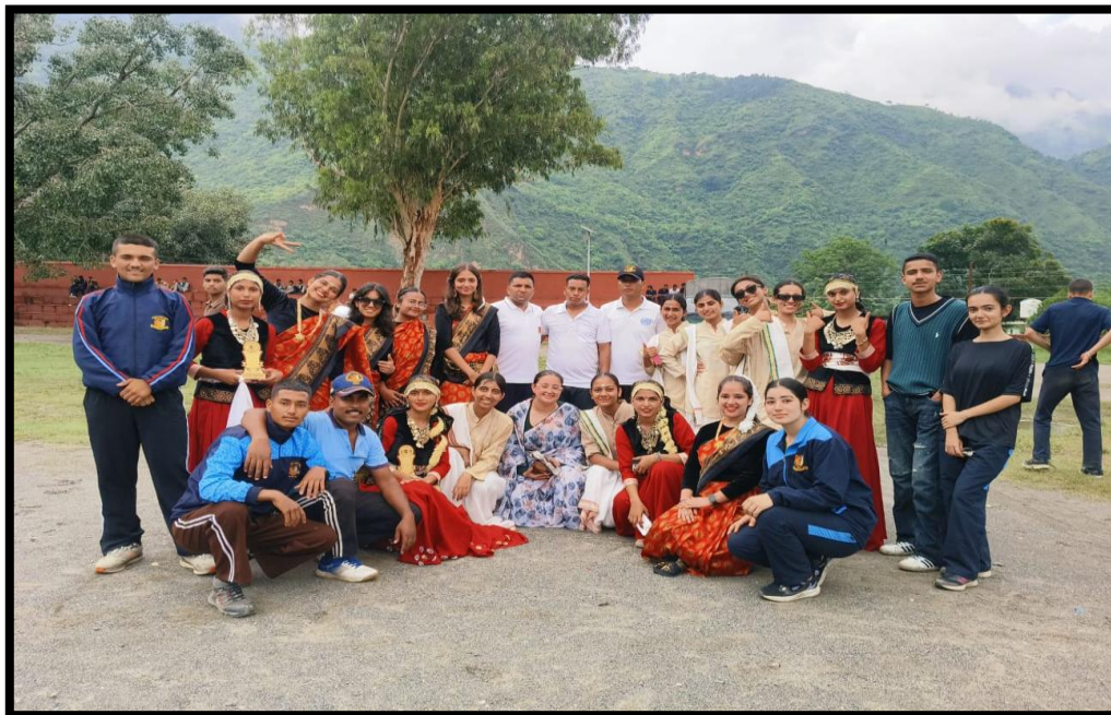
Cadets during camp