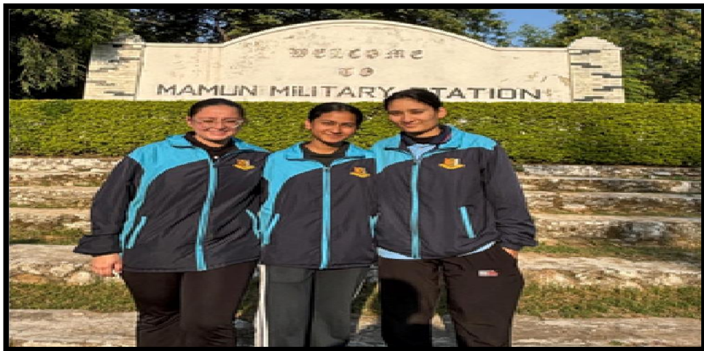
Cadets during attachment camp at Pathankot

visited different units, including Artillery, Armored, and Engineer units, where they learned about the roles, equipment, and strategies employed by each division. The cadets also had the privilege of interacting with gallantry awardees and Lady Officers, which served as a source of motivation and inspiration. The training sessions included practical exposure to drill and firing with the 5.56 mm INSAS rifle, enhancing their confidence and precision. Additionally, they gained knowledge about advanced military equipment such as the 81 mm mortar and experienced modern warfare techniques through a drone simulator. The Army Attachment Camp proved to be a highly valuable and enriching experience for the cadets. It not only enhanced their understanding of military life but also strengthened their discipline, confidence, and sense of responsibility. Their participation reflected the true spirit of NCC and brought pride to St. Bede's College.