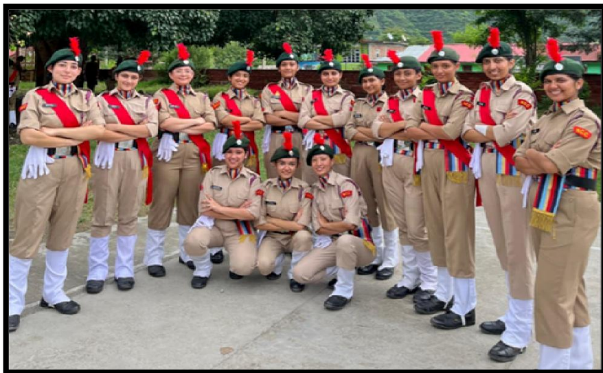
Group photograph during CATC-2