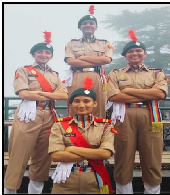
Cadets Group photograph during Independence Day

The participation of the cadets not only brought laurels to the college but also reinforced the values of discipline, leadership, and excellence that define the NCC. The event stood as a testament to the hard work and dedication of the cadets, making it a memorable and proud moment for St. Bede's College.