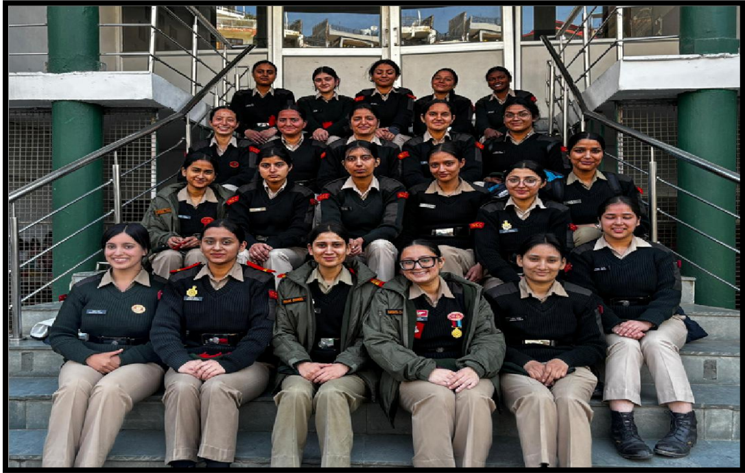
Cadets after NCC CEE Exam