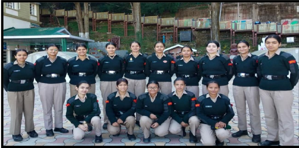
Cadets after NCC BEE Exam